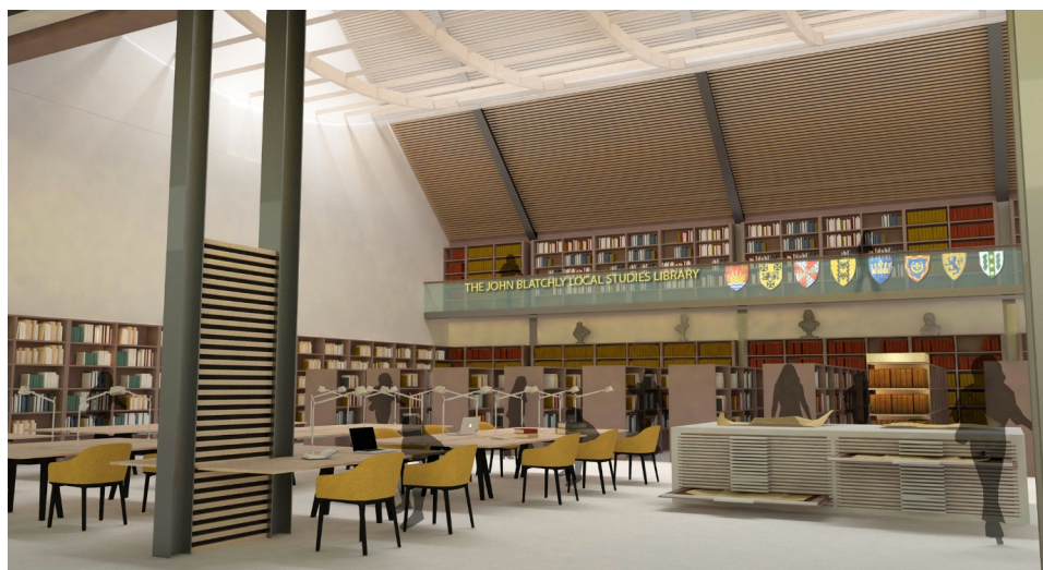
Artist's impression of the John Blatchly Local Studies Library at The Hold

I would like to end by thanking everyone who has contributed to FOSRO's joint fundraising campaign with the Suffolk Archives Foundation for the ' John Blatchly Local Studies Library ' at The Hold. While we remain short of the ambitious £100,000 target, there has been great generosity from FOSRO members and others. The Local Studies Library will be at the heart of The Hold and will form a fitting tribute to this great man. It is still possible to contribute at: www.mydonate.bt.com/fundraisers/blatchlyappeal