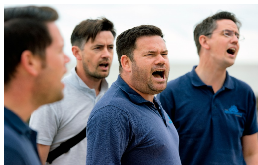
Bringing heritage to life through song – 'Sharing Suffolk Stories' partners the Rogue Shanty Buoys